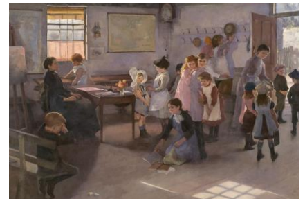
School is Out, 1889 by Elizabeth Forbes

The colony thrived into the late 1890s when its common ethos began to evaporate. It was then that two of the artists, Stanhope and Elizabeth Forbes, founded their School of Painting, bringing a new generation of artists to Newlyn, including Dod and Ernest Procter and Frank Gascoigne Heath. This re-energizing of the colony attracted further artists, such as Samuel John 'Lamorna' Birch, Alfred Munnings, and Laura and Harold Knight, many of whom later settled in Lamorna, forming the Lamorna group.