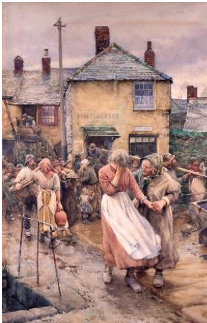
Among the Missing, 1884 by Walter Langley

Penlee House Gallery & Museum is in the town of Penzance, in Cornwall, England, and specializes in the works of the Newlyn School and Lamorna Group.